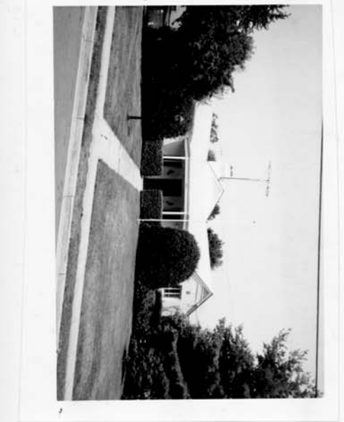
PHOTO REMARKS 4-23-78 ok for finalized after over near 15 p.m. 1901 4