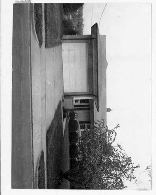
PHOTO REMARKS 83 $43,500 4,000.00c. $39,500 4 - '77 Only Inc Land + 10% 196x 81c. 7/2/81. Reduce lot size to 11000 for 1st shippage at back of lot 34