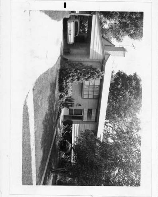
PHOTO REMARKS 3x R/TL Inc Land + 10% 1/967 Bldg 90% Mc K/E - 10/80