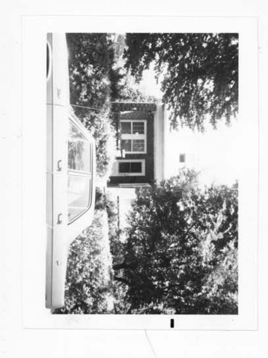
PHOTO REMARKS NOTE: 7/1/82 check 057 2058 for mission 077-048 for mission 34 1952